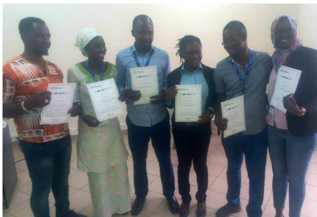
Some participants with their training certificates