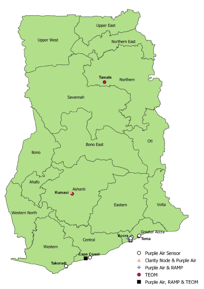
Figure 1: Map of Ghana showing the location of sensors